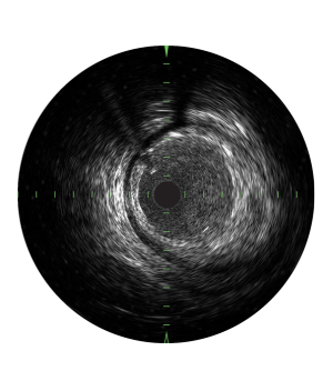
Clarispro IVUS Image 35-65 MHz extended bandwidth